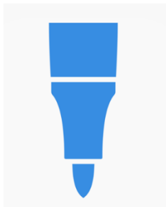
Sketches School app