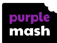
Purple Mash icon