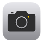
The camera icon