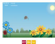
Test your mouse control skills with this game.