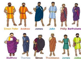
Jesus' 12 disciples.