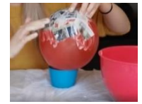
layers of newspaper