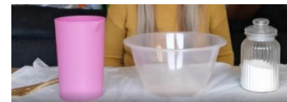
water mixing bowl and spoon flour