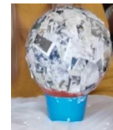
cover the balloon