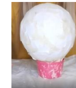
cover with white paper