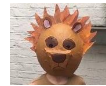
collage and paint