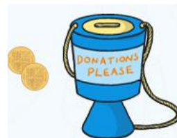
Zakat: Giving money to charity.