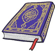
Shahada: Declaration to faith.